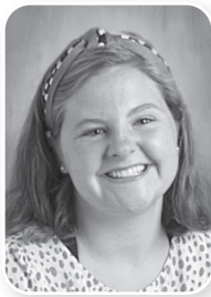
Maria Wesley ES - Teacher Assistant