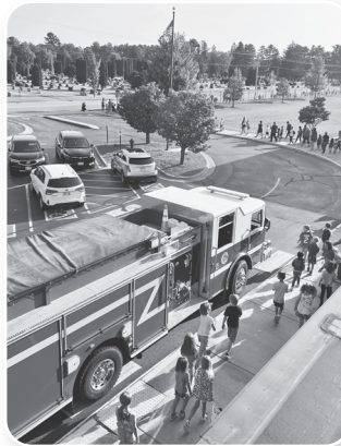
Pictured right: MES students and staff, along with family members and personnel from the Mosinee Fire Department, participated in the Freedom Walk.

In September, Mosinee Elementary students participated in a Freedom Walk in honor of Patriot Day. Classes also did activities on what freedom means, read books, made American flags, and wrote letters to veterans. They also wore red, white, and blue to show their patriotic colors.